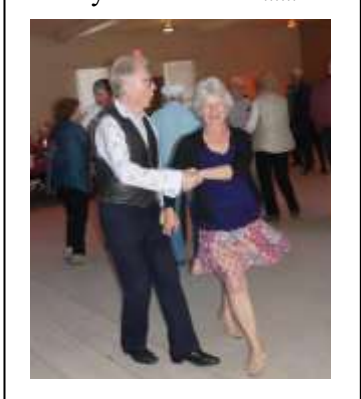
Swingers of March

Other WSS Orgs...... 12 Monthly Music Dances.....12