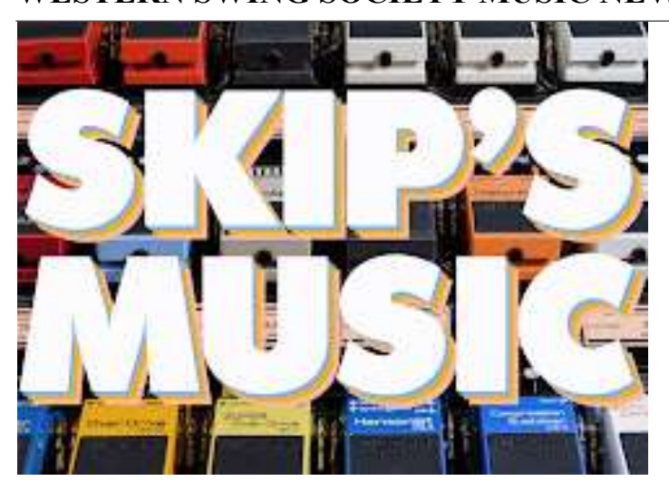
VISIT THE NEW LOCATION FOR THEIR NEW STORE @ 4614 Madison Ave. Sacramento CA 95841